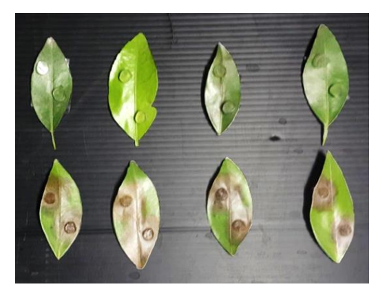
Fig.2. Pathogenicity test of Pythium spp. on detached tangerine leaves. A; Non-inoculated control. B; Inoculated control.

showed the fungus caused disease symptoms on tangerine leaves that were similar to the report of Mida et al. (2015) which reported pathogenicity test on detached leaves of Citrus jambhiri .